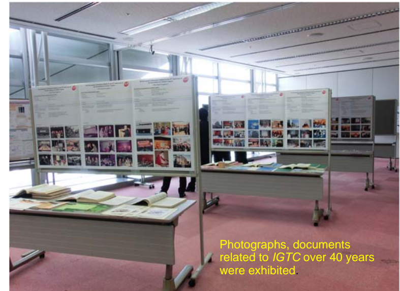
Photographs, documents related to IGTC over 40 years were exhibited.